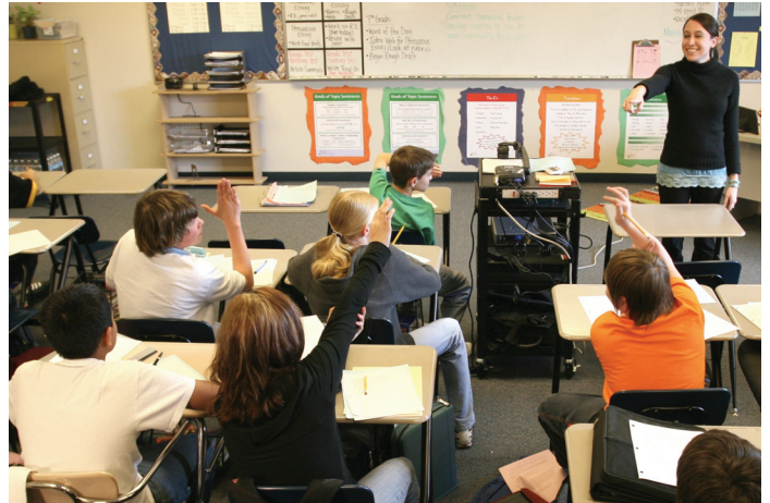
Students across the country are experiencing the positive impact of Overcoming Obstacles' instruction thanks to the Gifting Initiative.

"Our school has been offered a comprehensive life skills program that we could have never obtained had it not been for the Gifting Initiative," she said. "Despite our limited