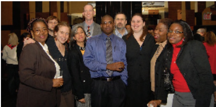
Educators from the Academy for Environmental Leadership attended the 2008 Achievement Awards gala to honor the accomplishments of New York City students using the Overcoming Obstacles Life Skills Program.

In Brooklyn, the Academy for Environmental Leadership wanted its students to learn more about their environments and how to be proactive in solving local community