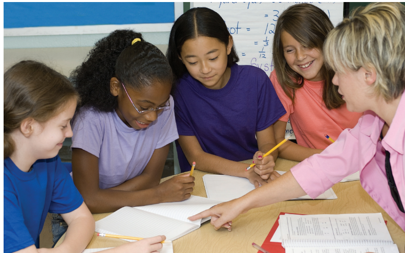
Advisories promote teamwork, leadership, and group problem solving strategies.

For Middle Schools, the Overcoming Obstacles program helps educators meet the challenges of acclimating new sixth graders, keeping seventh graders focused, and moving eighth graders progressively forward